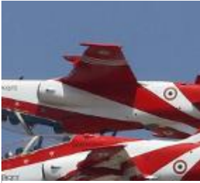
Day 3: Aero India-2017 at Yel...